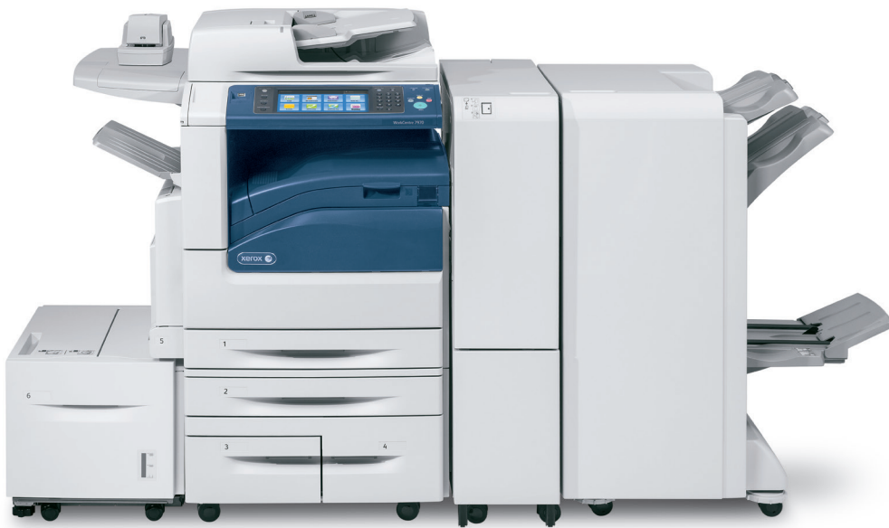
WorkCentre 7970 shown with optional BR Booklet Maker Finisher, C Fold / Z Fold Unit, High Capacity Feeder and Convenience Stapler.