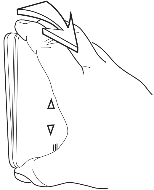
Illustration 2 - Faceplate Removal

This mode is enabled when the thermostat is being used with the snowmelt elements. The external temp sensor is installed in the concrete and the Set Temperature is adjustable between 32-41F/0-5C. This value is maintained in flash memory. The display will show this measurement and, as with external mode, when both the UP/DOWN switches are pressed and released within 1 second, the display will show the ambient temperature for a short period after which it will revert to the external temperature sensor. When in SnowMelt Mode, the snowflake logo on the front panel will glow blue.