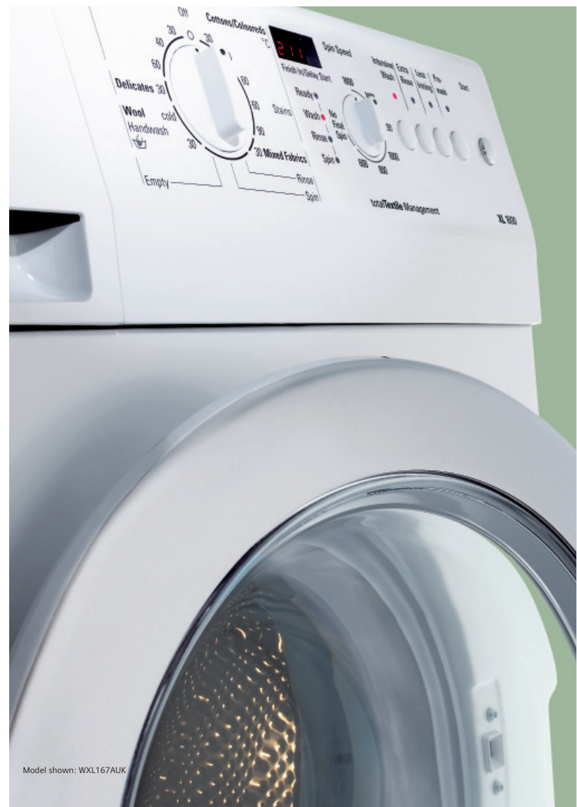
Model shown: WXL167AUK