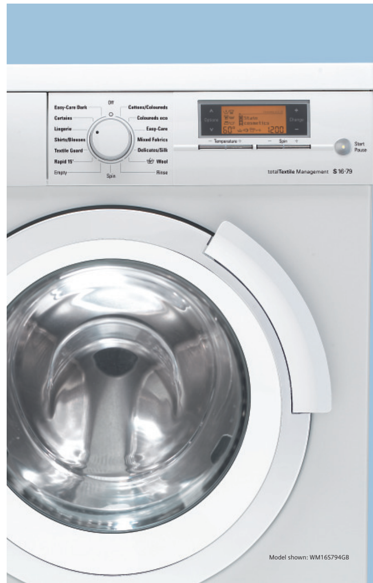
Model shown: WM16S794GB