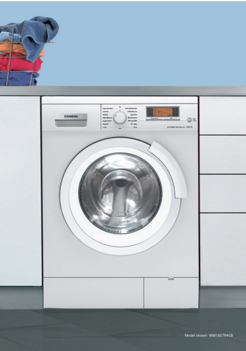
Model shown: WM16S794GB