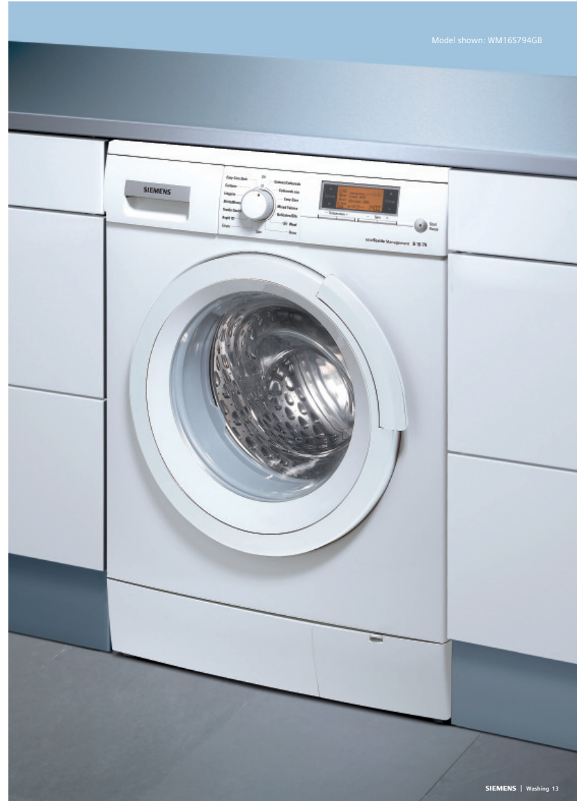
Model shown: WM16S794GB

Ultimate woolCare system : a gentle cradle system that treats delicate wool and cashmere with the utmost care throughout both the washing and drying process.