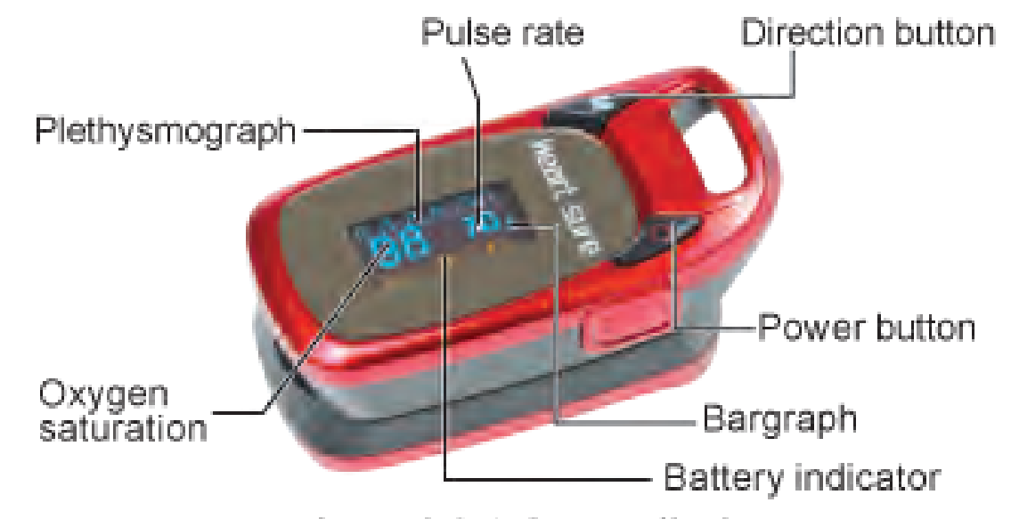
Figure 3.2.1 OLED display

After being switched on, the OLED display is as follows: