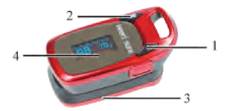
Figure 3.1.1 Parts of front & back panel

3.1. Description of the Front Panel (as figure 3.1.1)