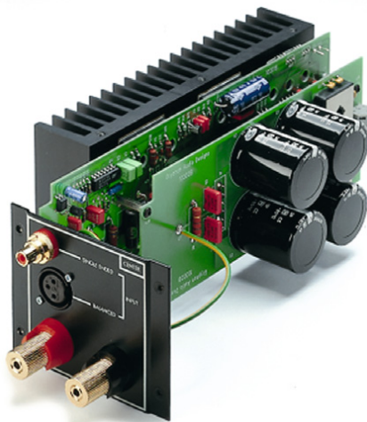
Typical Gryphon module

The heavy, thick chassis offers a vibration-proof environment for the sensitive electronics inside and provides crucial shielding from a polluted world of low and high-frequency radio waves, power-line radiation and other