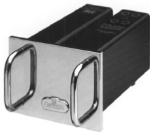
The Gryphon Head Amp 1985

Gryphon Audio Designs was founded in 1985 as an offshoot of 2R Marketing. The first product, the now legendary Gryphon Head Amp, grew from a one-off spare time project developed only for the designers' own home systems. Although the Gryphon project was initially strictly a hobby, not an actively pursued commercial venture, demand generated by reviews and word-of-mouth led to the formal establishment of Gryphon Audio Designs as a separate corporate entity.