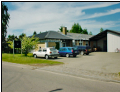
Gryphon Audio Designs in the outskirts of the small town of Ry.